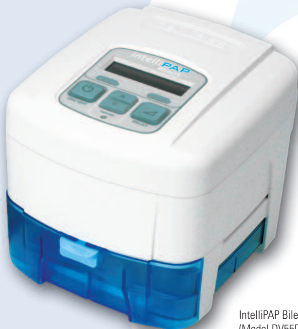
IntelliPAP Bilevel (Model DV55D-HH)

Once again, you talked. We listened. Everyone gets what they need.